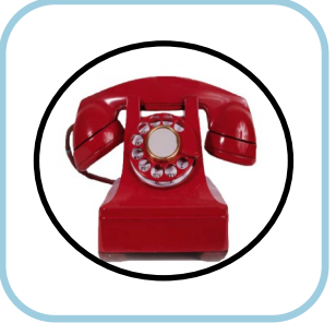
Hotline - Available 24/7 REPORT ANONYMOUSLY